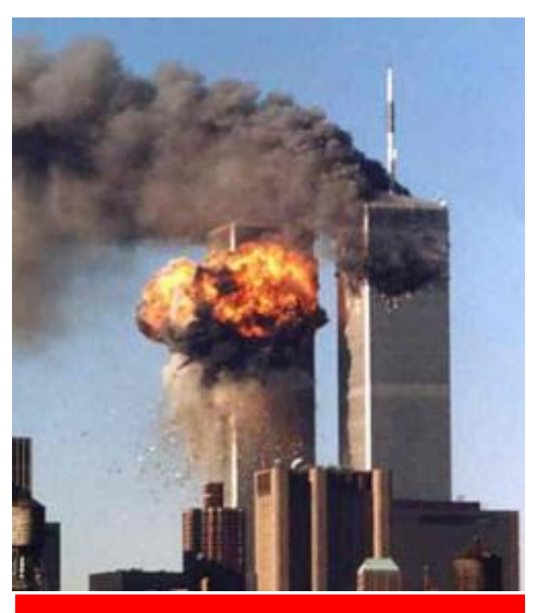
9-11, Never Forget!