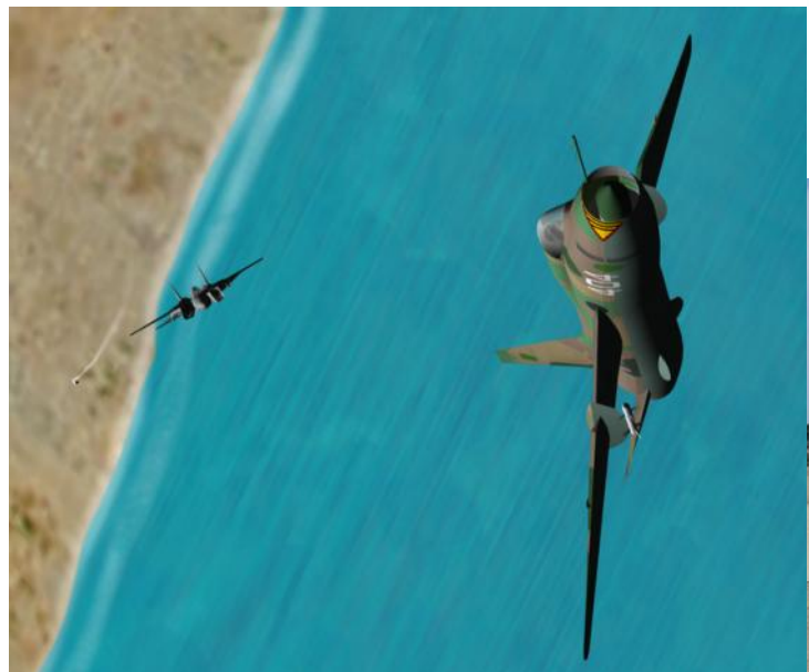
Artist's depiction of Fast Eagle 107 's AIM-9 Sidewinder about to hit a Libyan Su-22.