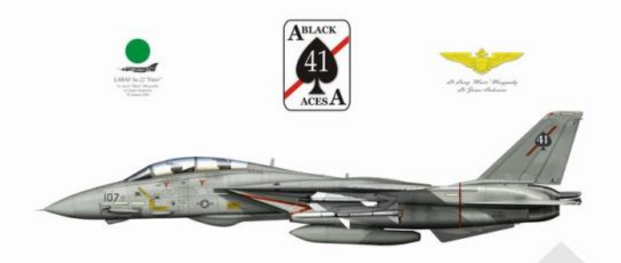
Grumman F-14A "Tomcat" F-HA-80-GR Bu-An-No.160403 AD107 "For Eagle Yell" Fighter Squadron FOUR ONE - VF-41 "Black Aces" USS Nimitz (CVN-68), August 1981