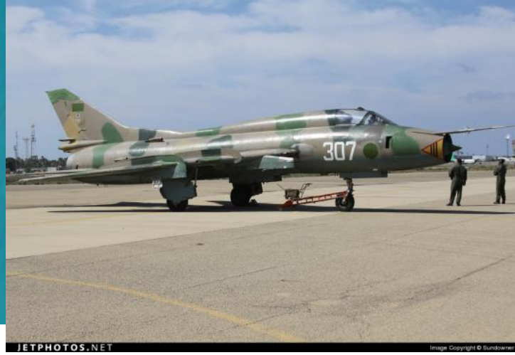
Libvan Sukhoi Su-22 Fitter